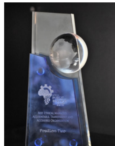
Trophy for Best Ethically managed, Accountable, Transparent and Accessible Organisation