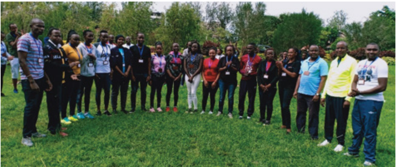
KenTrade team members await for cue from the facilitator during the team building event