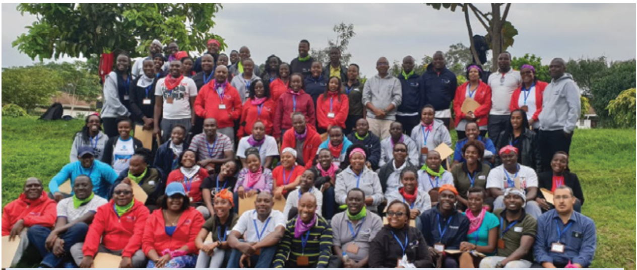
KenTrade family and facilitators from SBO Research company in a group photo after the team building event.